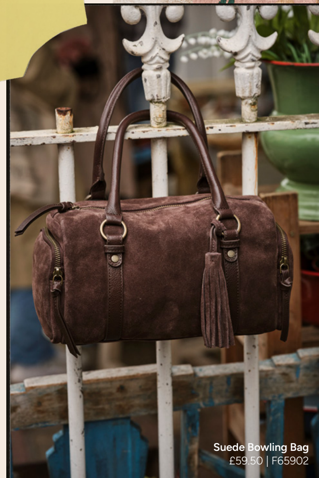
Suede Bowling Bag £59.50 | F65902