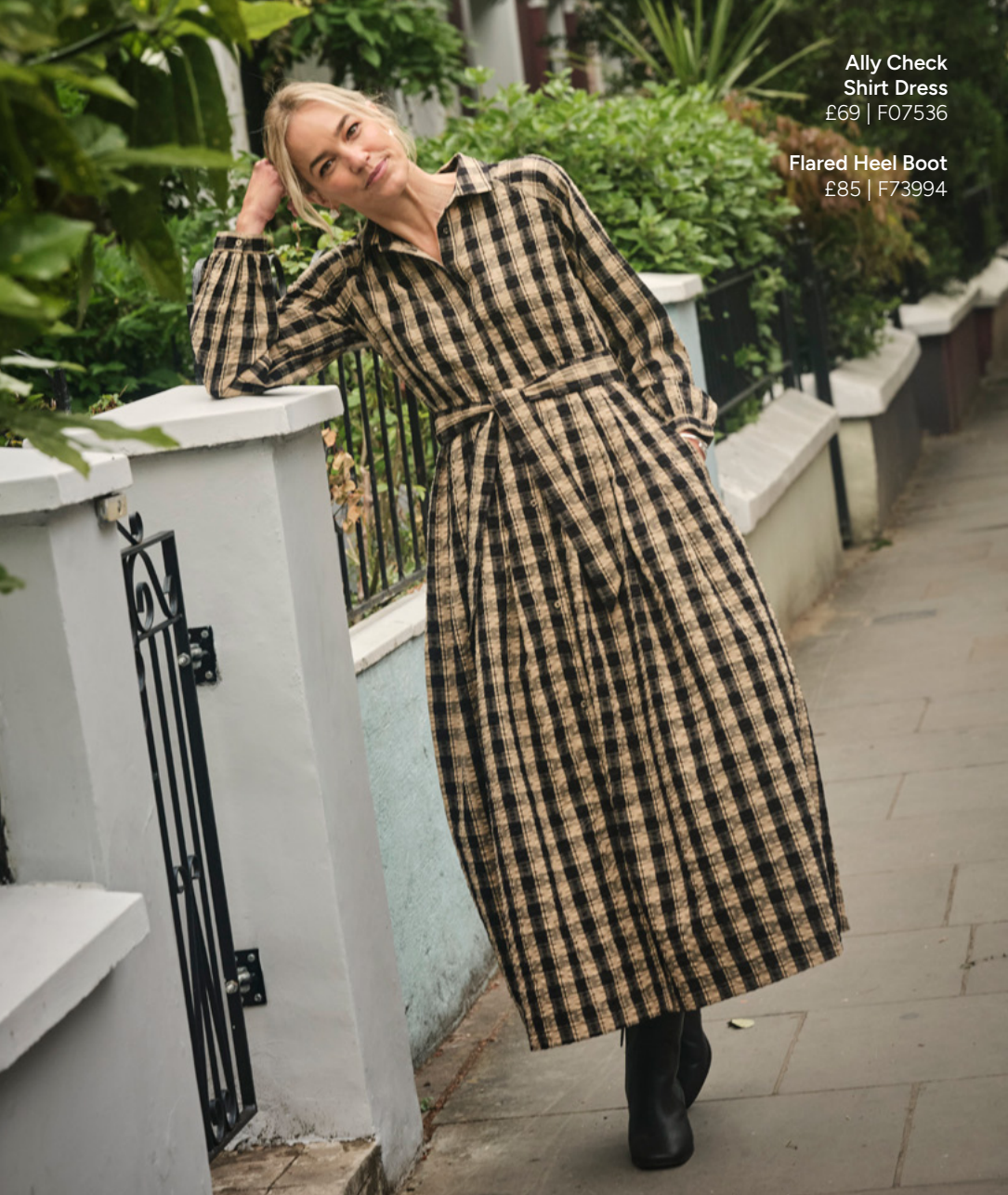
Ally Check Shirt Dress £69 | F07536