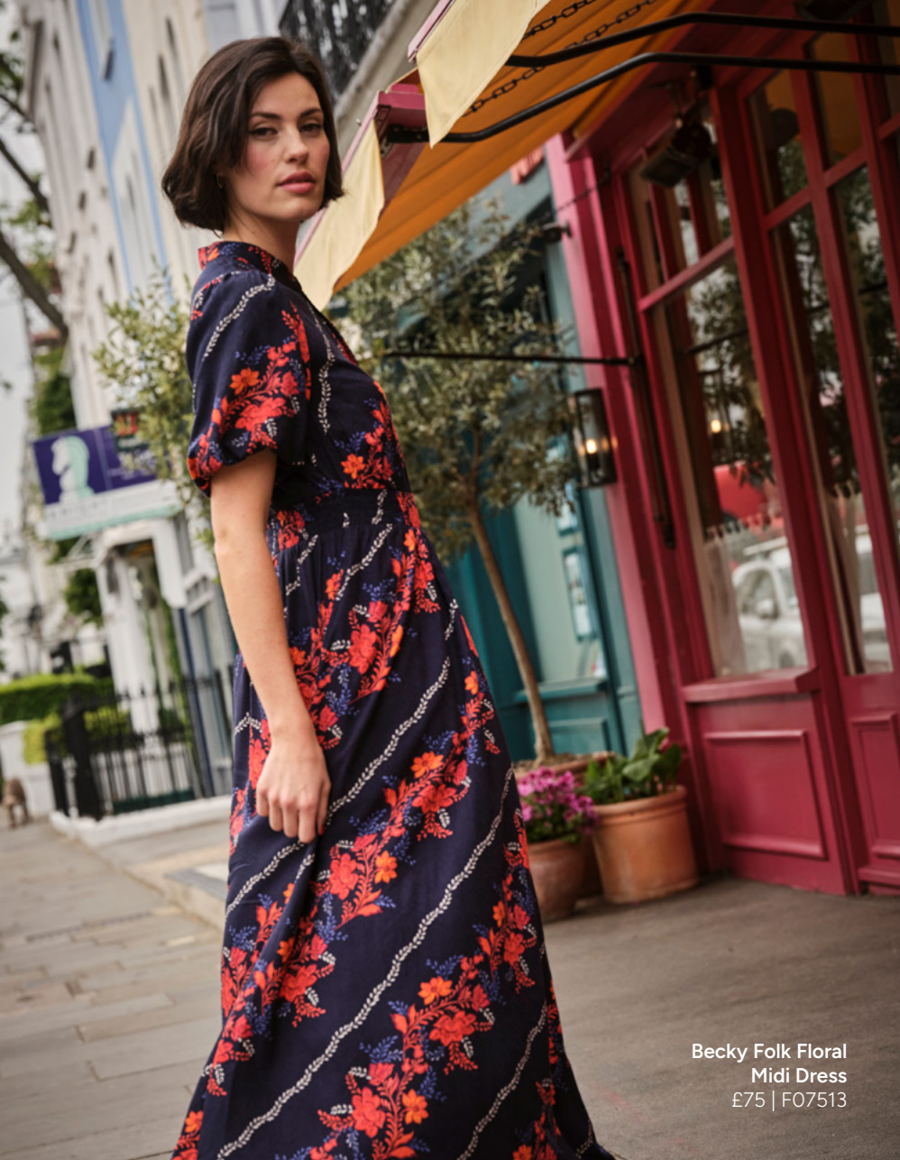
Becky Folk Floral Midi Dress £75 | F07513