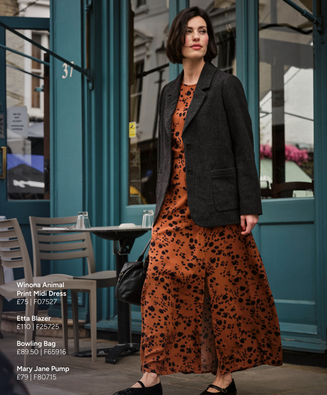
Winona Animal Print Midi Dress £75 | F07527