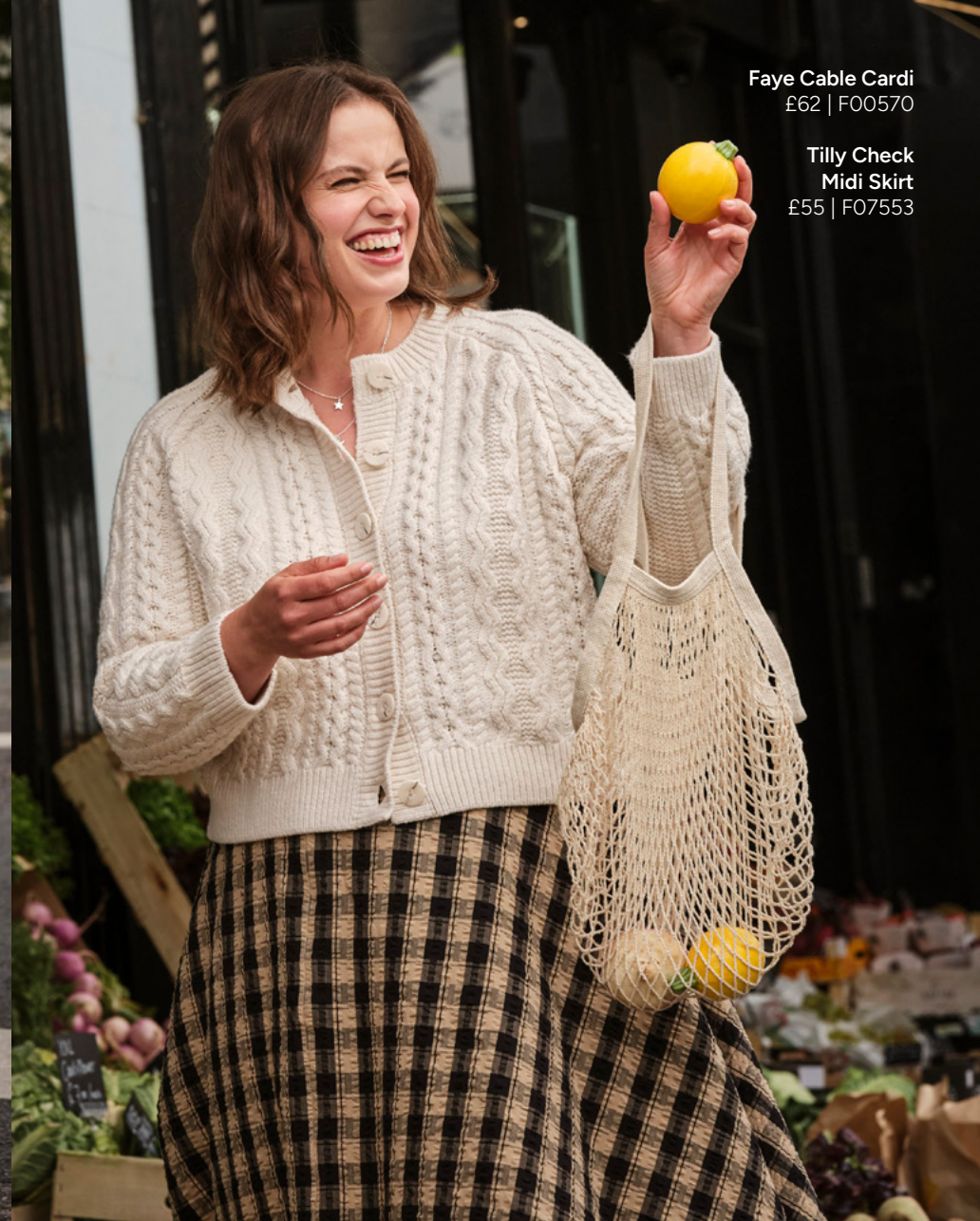
Faye Cable Cardi £62 | F00570