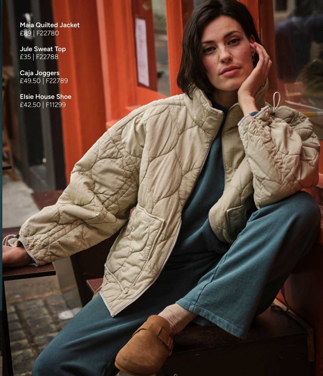
Maia Quilted Jacket £89 | F22780