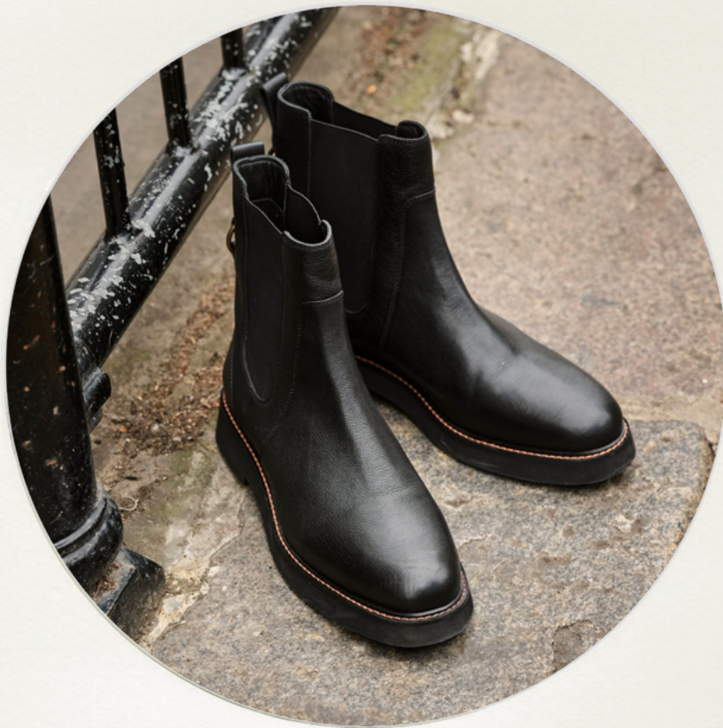
Rowe Chelsea Boots £95 | F55967