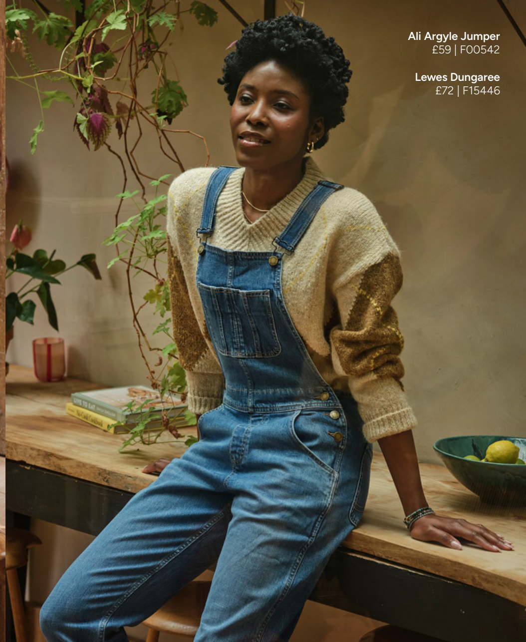
Ali Argyle Jumper £59 | F00542