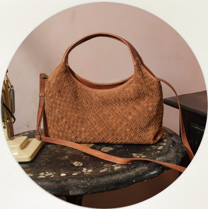
Esme Woven Bag £99.50 | F65910