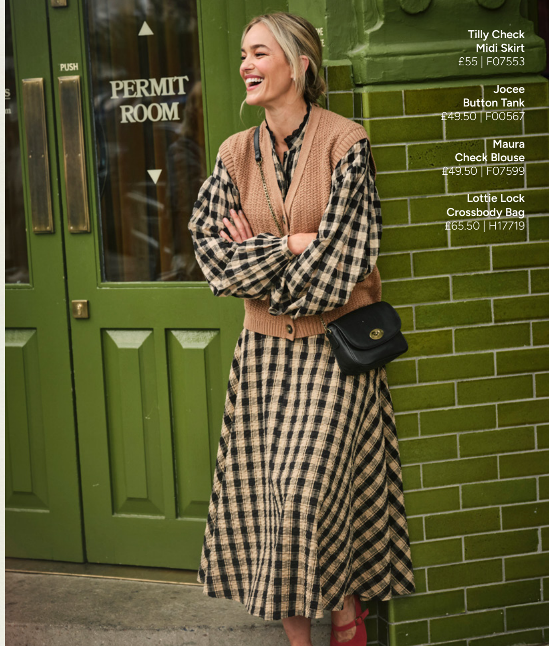
Tilly Check Midi Skirt £55 | F07553