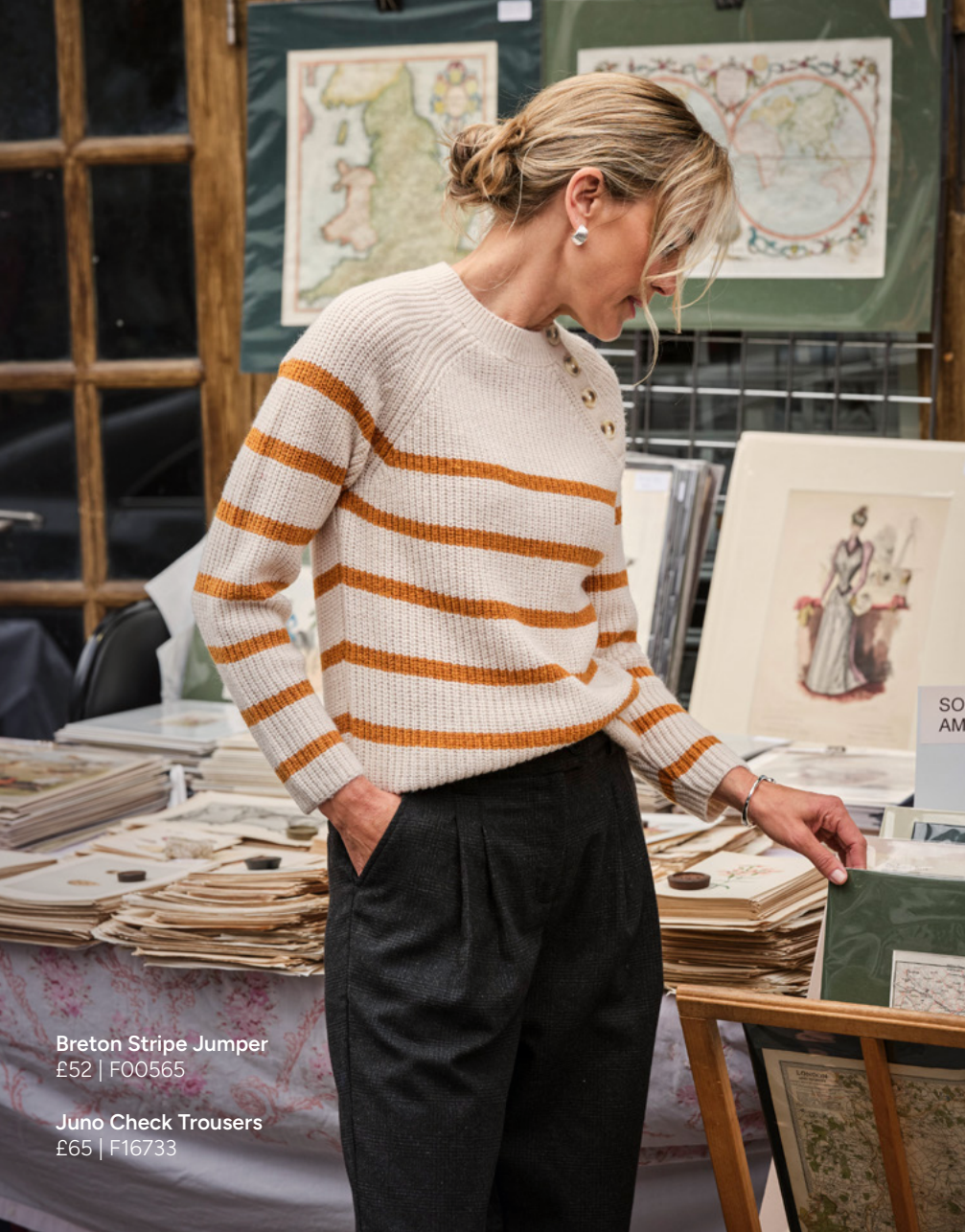
Breton Stripe Jumper £52 | F00565