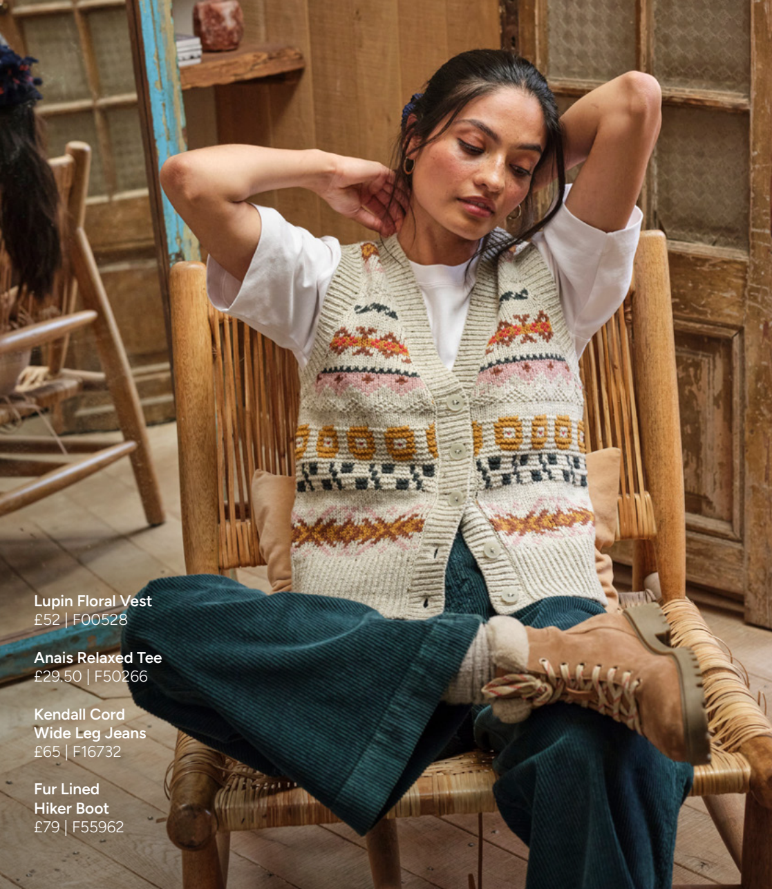
Lupin Floral Vest £52 | F00528