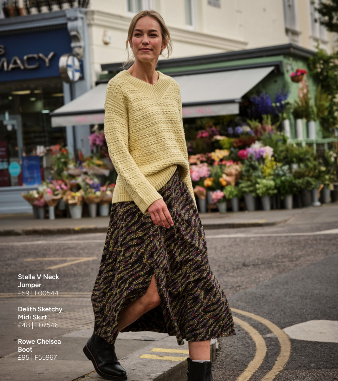
Stella V Neck Jumper £59 | F00544