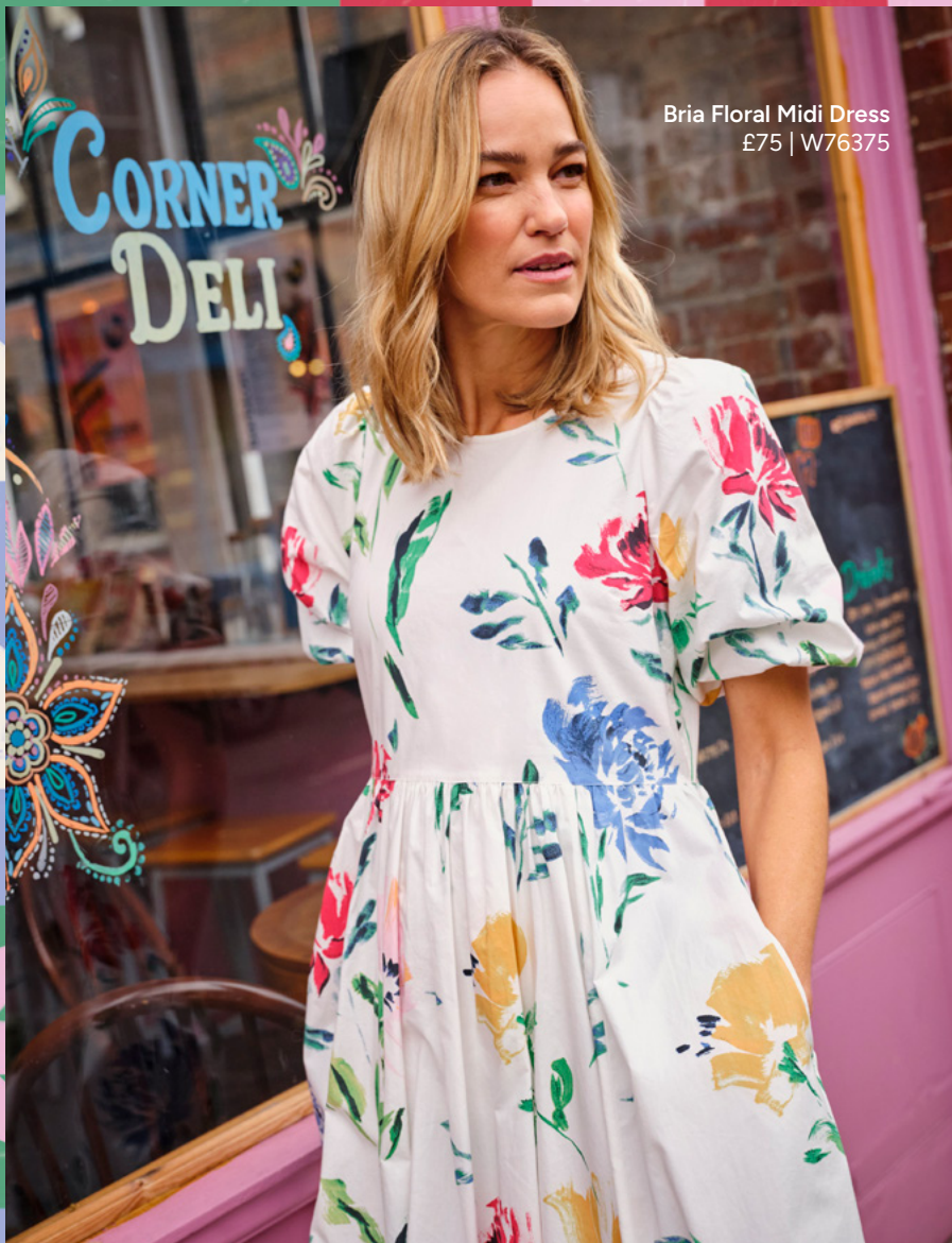
Bria Floral Midi Dress £75 | W76375