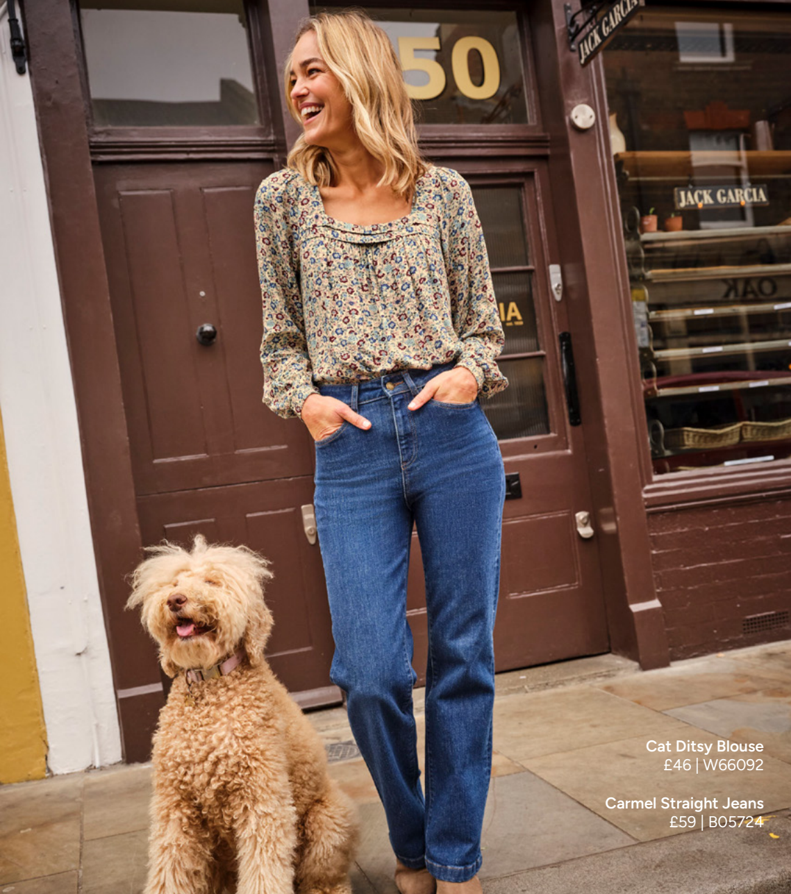
Cat Ditsy Blouse £46 | W66092