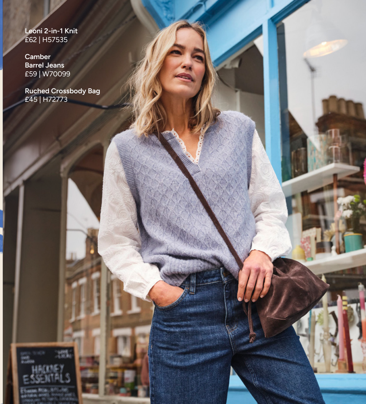
Leoni 2-in-1 Knit £62 | H57535