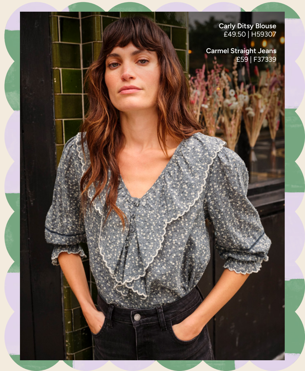
Carly Ditsy Blouse £49.50 | H59307