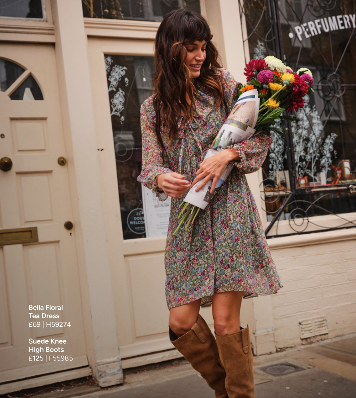
Bella Floral Tea Dress £69 | H59274