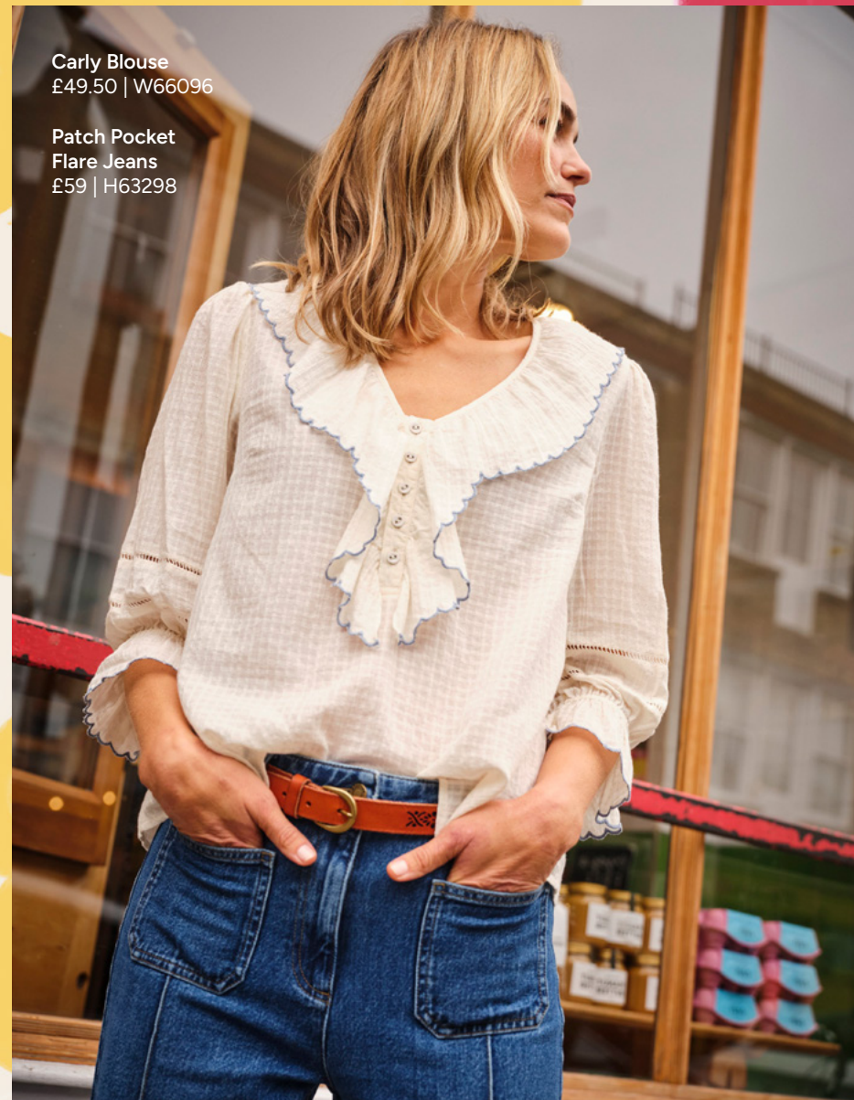
Carly Blouse £49.50 | W66096