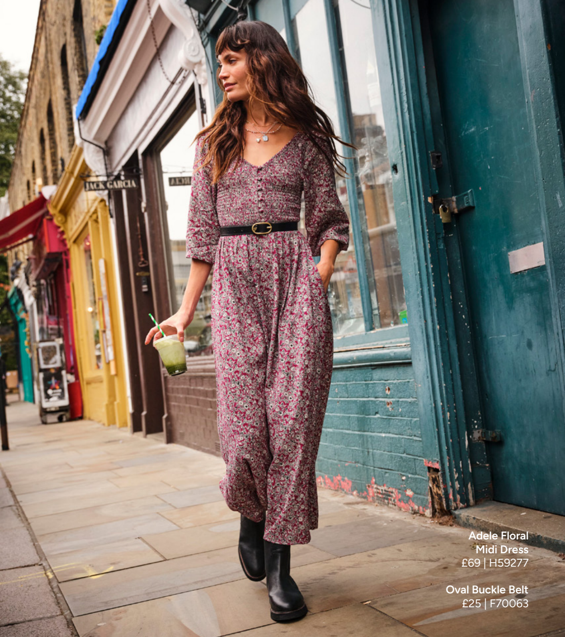
Adele Floral Midi Dress £69 | H59277