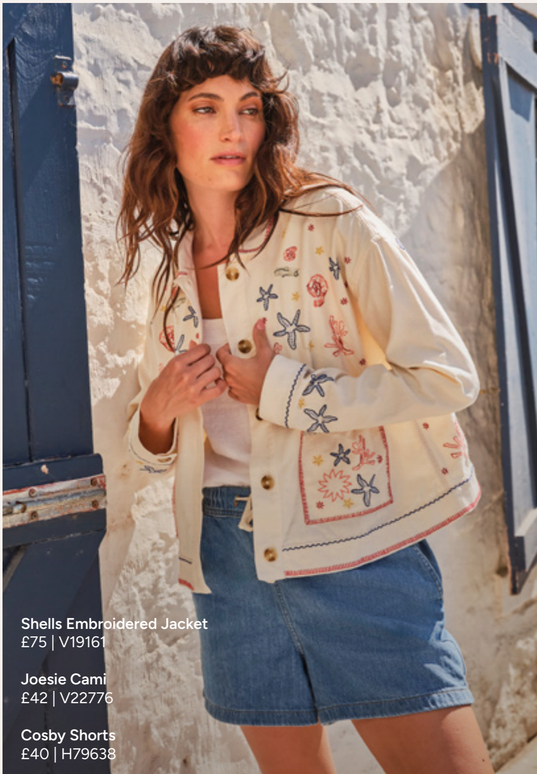
Shells Embroidered Jacket £75 | V19161