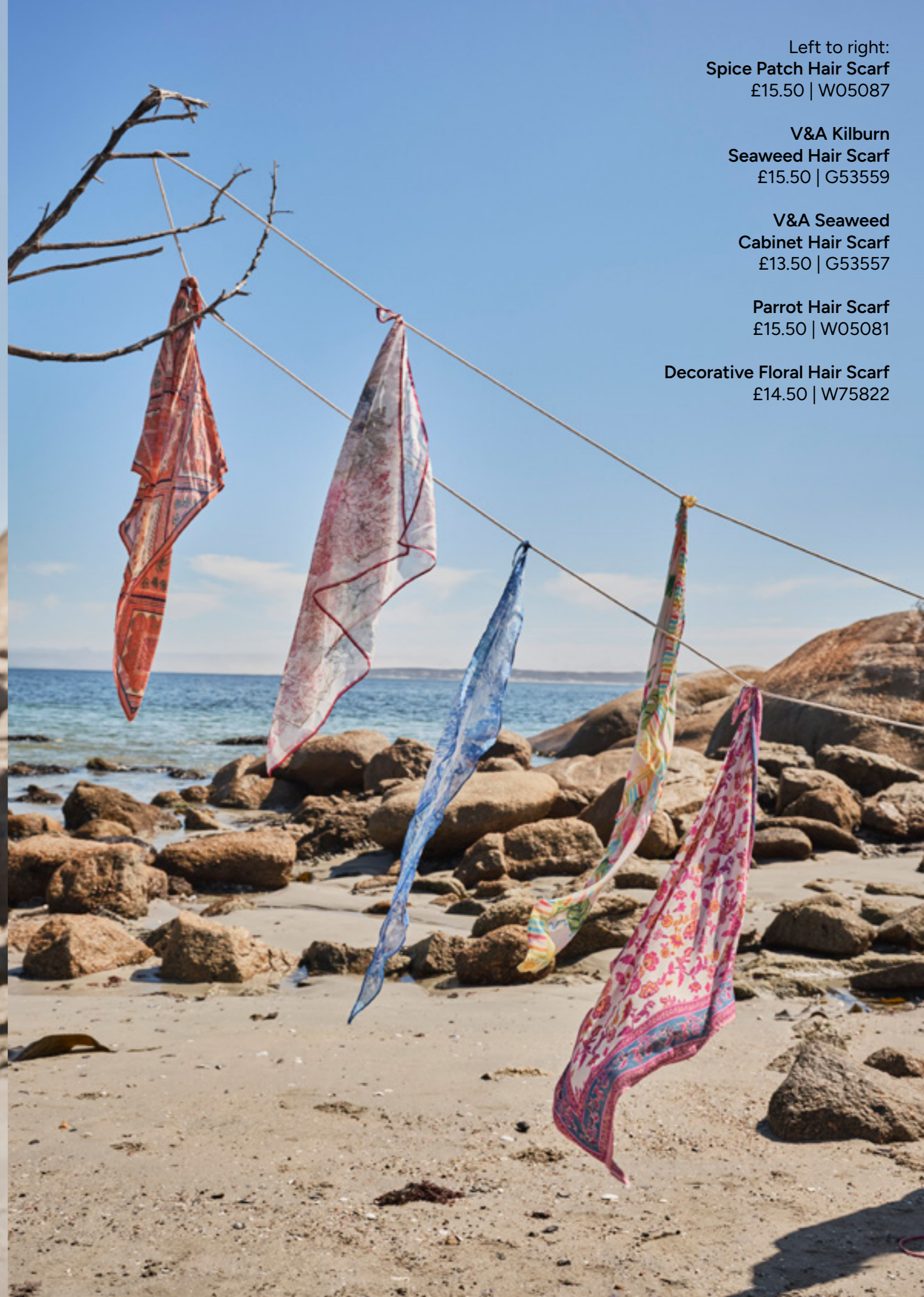
Decorative Floral Hair Scarf £14.50 | W75822