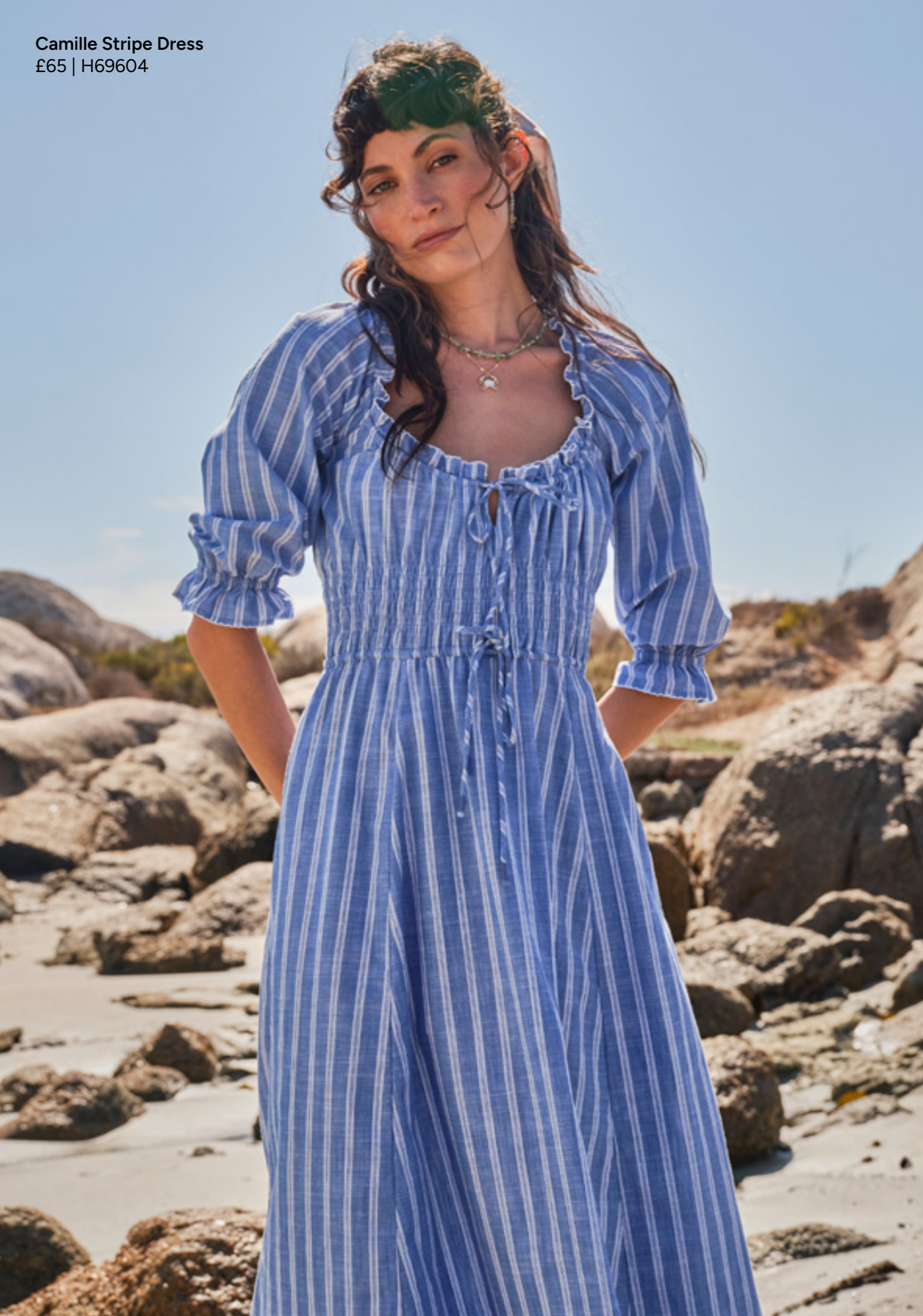
Camille Stripe Dress £65 | H69604