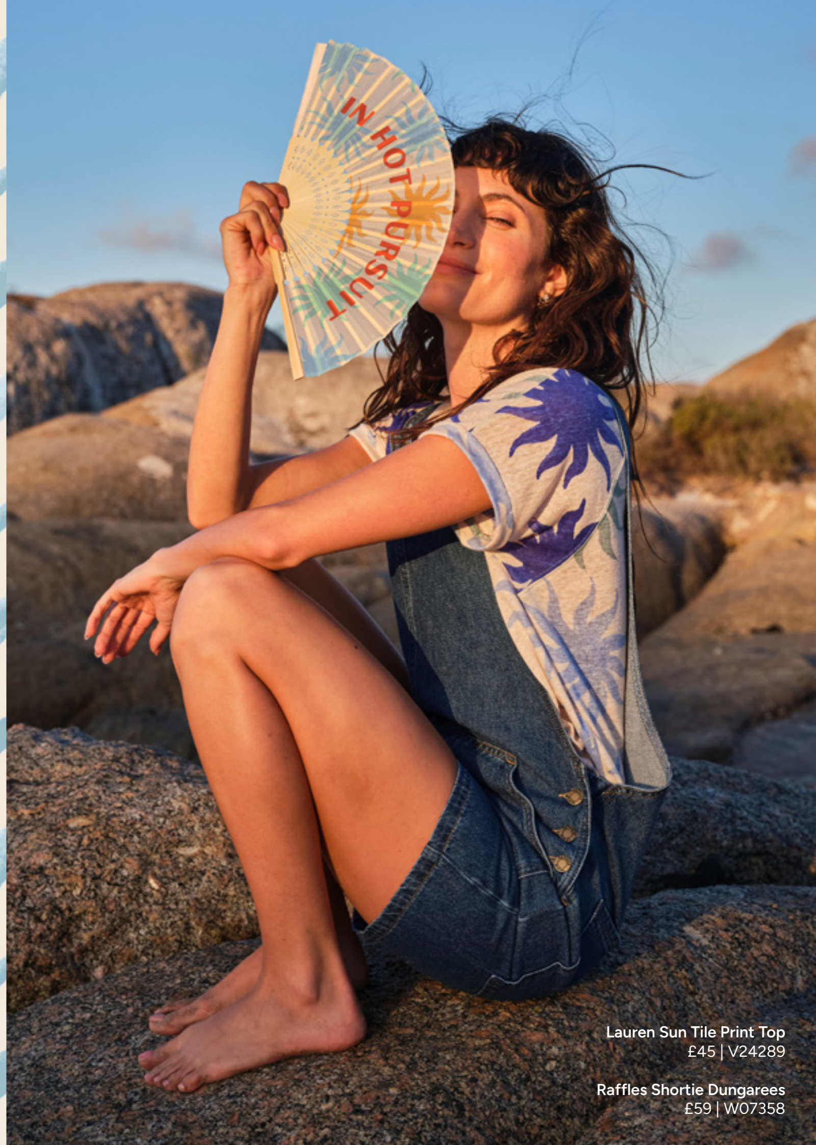
Lauren Sun Tile Print Top £45 | V24289