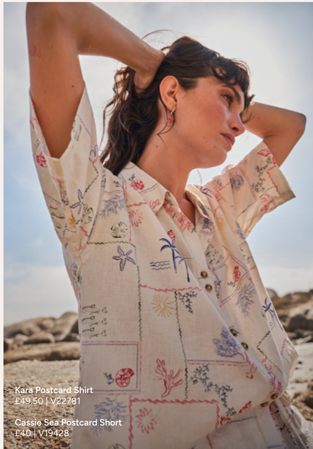
Kara Postcard Shirt £49.50 | V22781