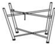
Table stand B x 1PC