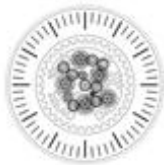
Table Top A x 1PC