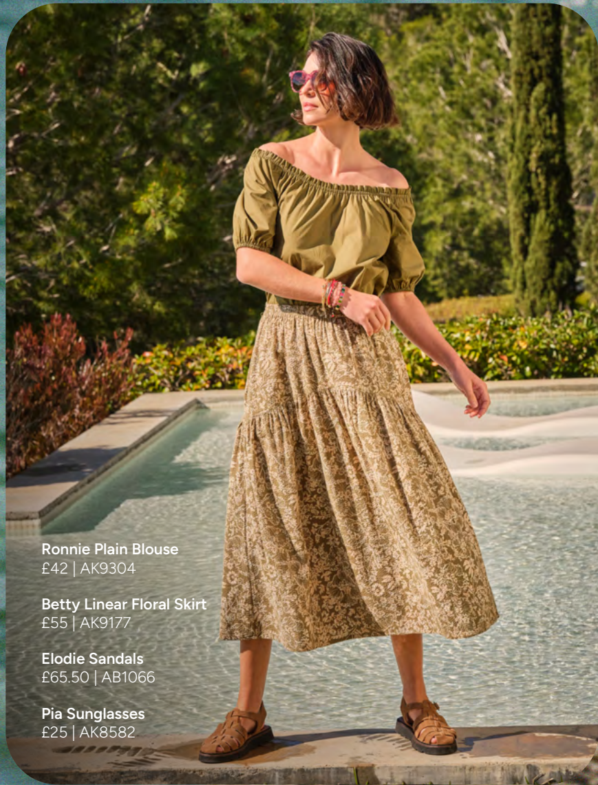
Ronnie Plain Blouse £42 | AK9304