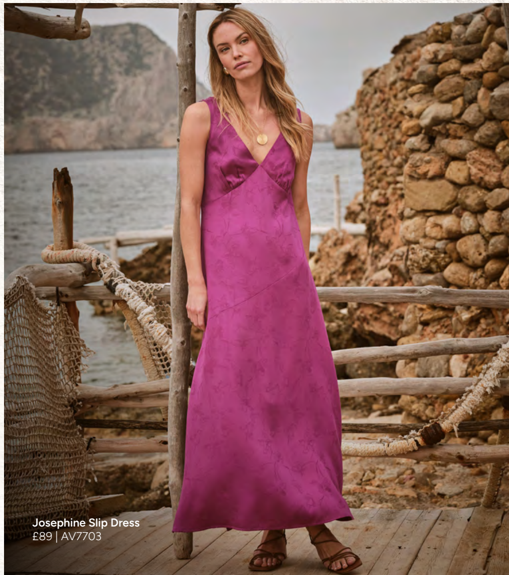
Josephine Slip Dress £89 | AV7703