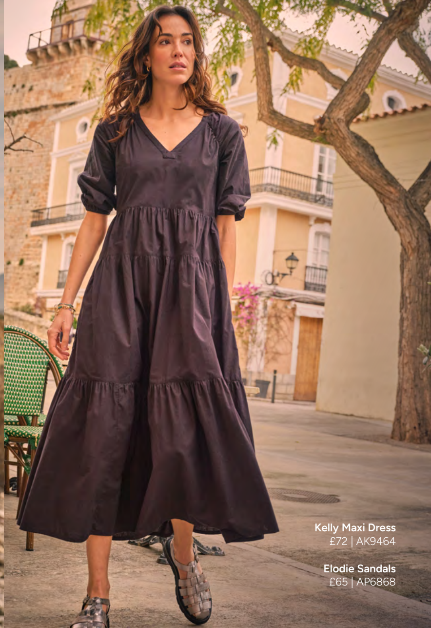
Kelly Maxi Dress £72 | AK9464