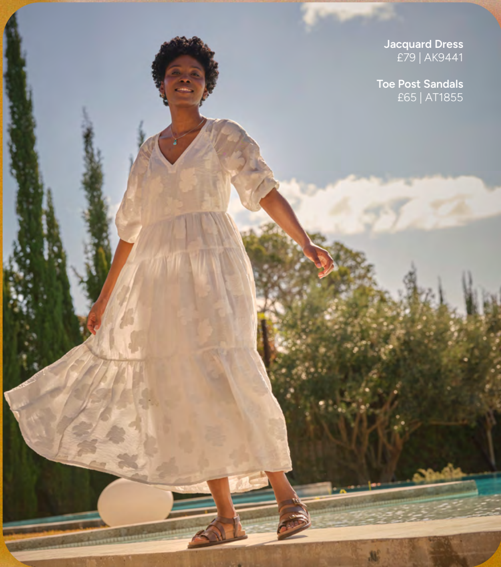
Jacquard Dress £79 | AK9441