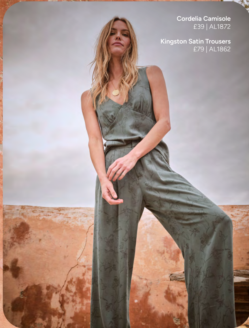
Kingston Satin Trousers £79 | AL1862