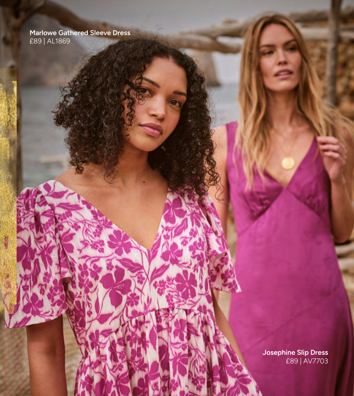
Josephine Slip Dress £89 | AV7703