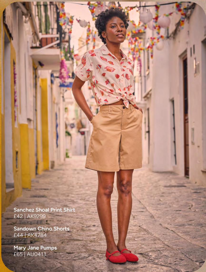
Sanchez Shoal Print Shirt £42 | AK9299