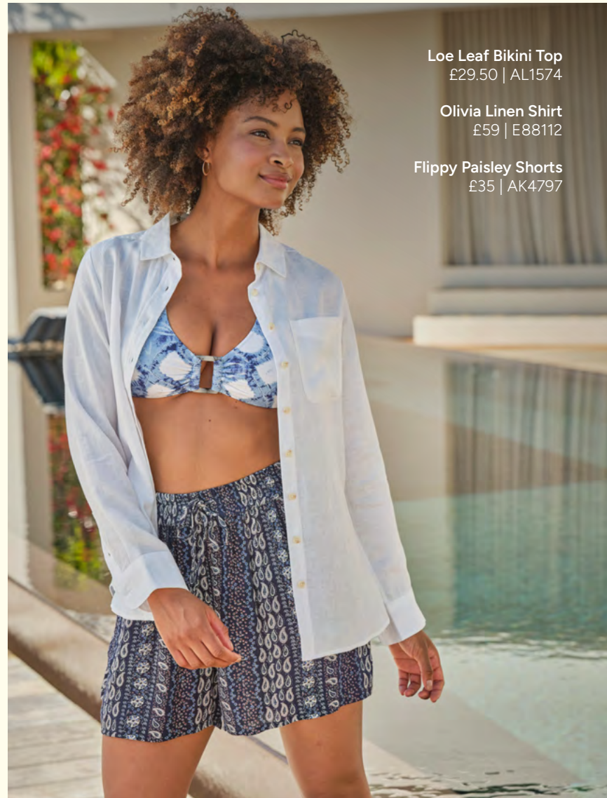
Loe Leaf Bikini Top £29.50 | AL1574