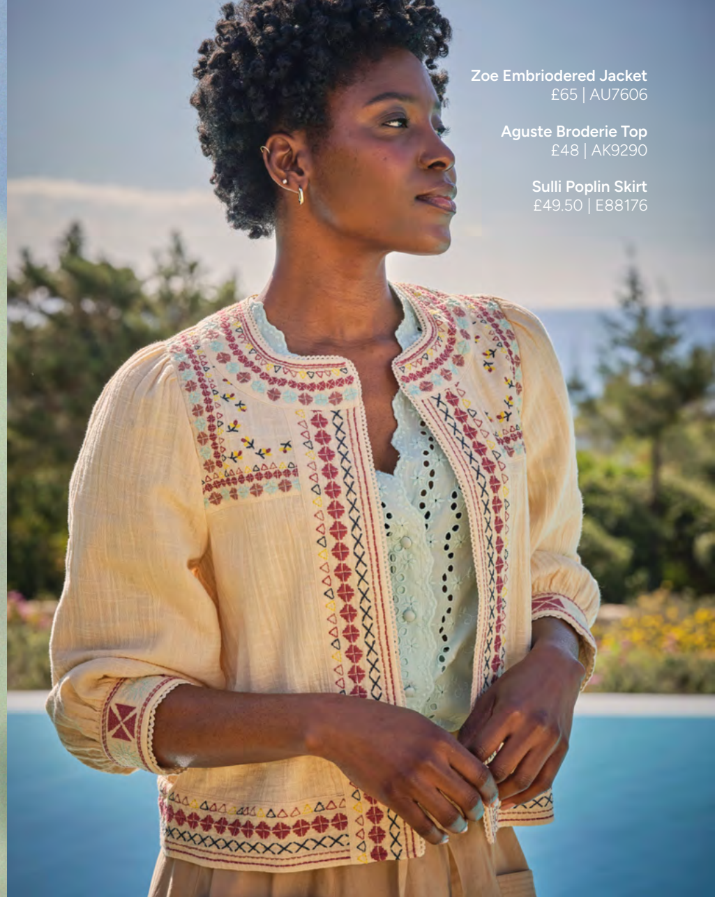
Zoe Embroidered Jacket £65 | AU7606