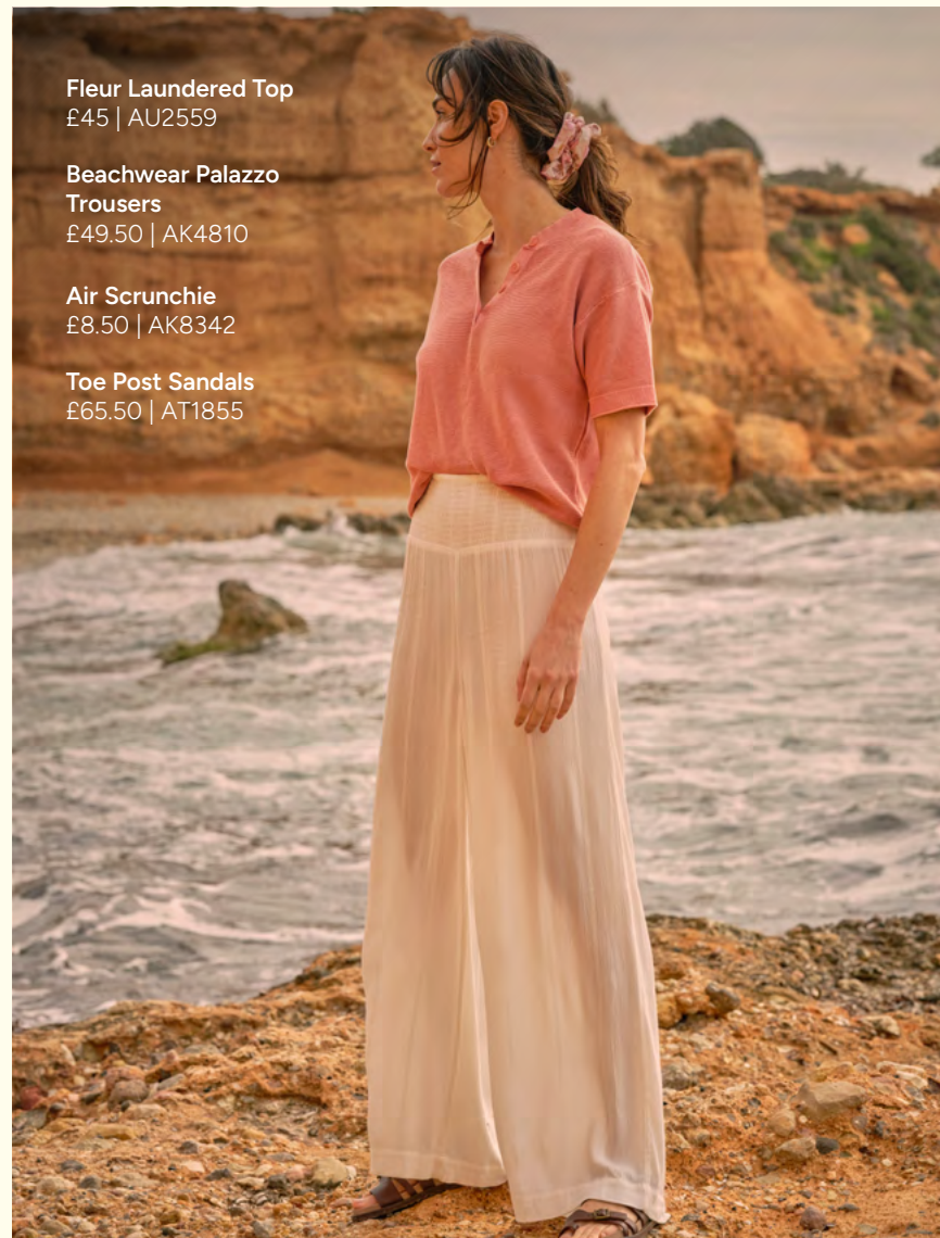
Fleur Laundered Top £45 | AU2559