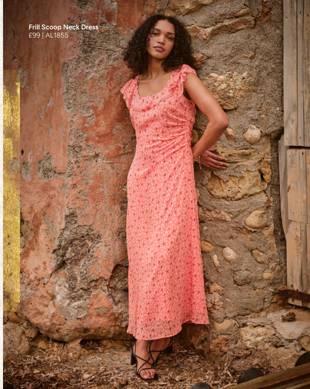
Frill Scoop Neck Dress £99 | AL1855