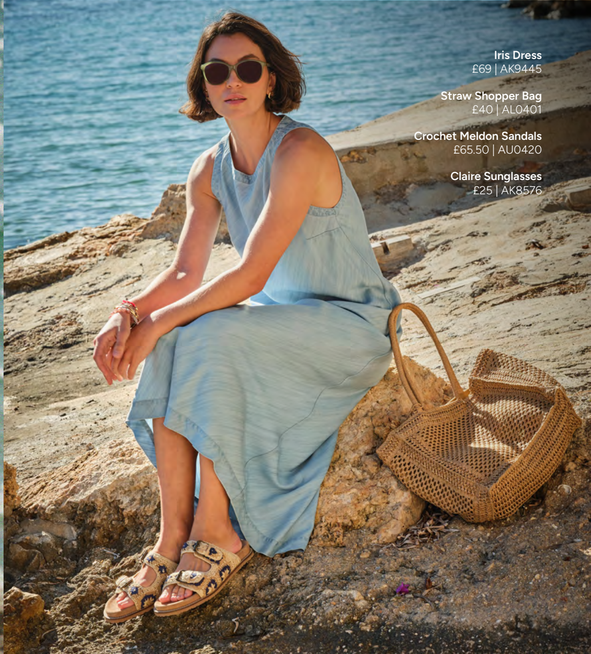
Iris Dress £69 | AK9445