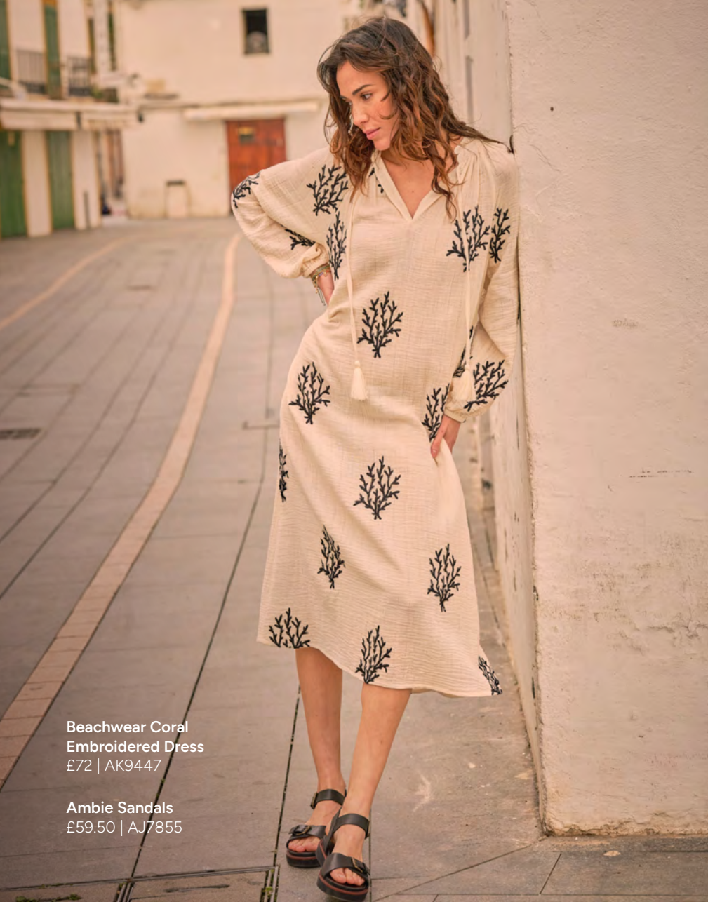
Beachwear Coral Embroidered Dress £72 | AK9447