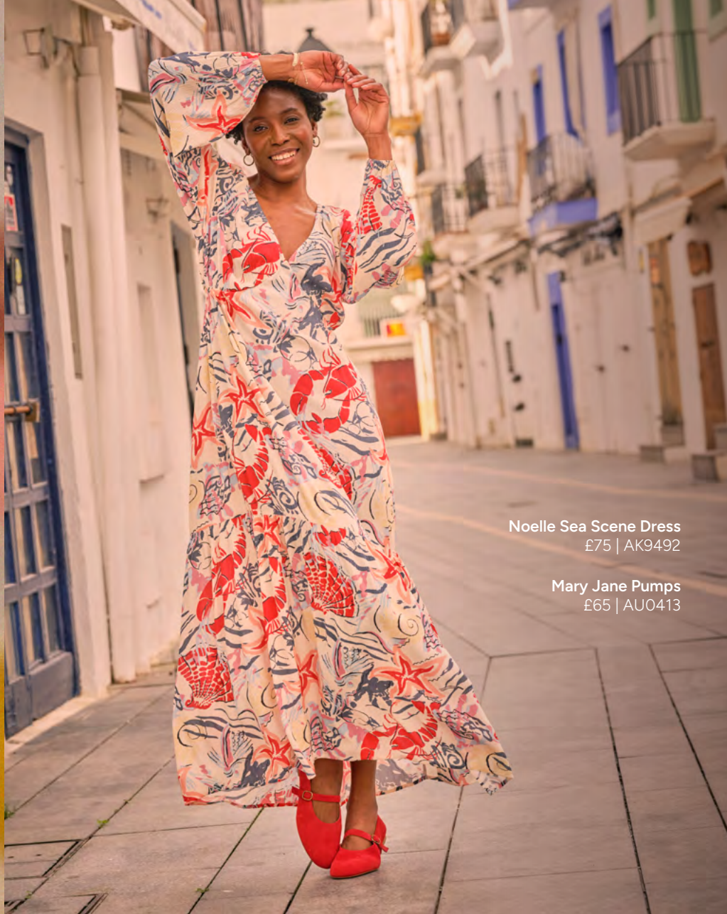
Noelle Sea Scene Dress £75 | AK9492