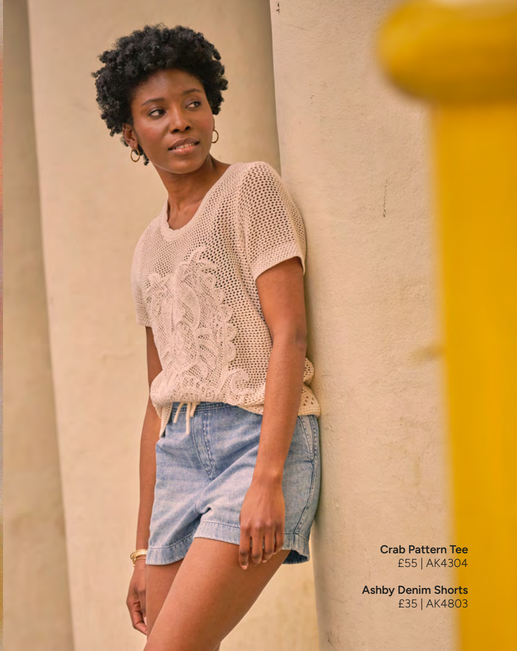
Crab Pattern Tee £55 | AK4304