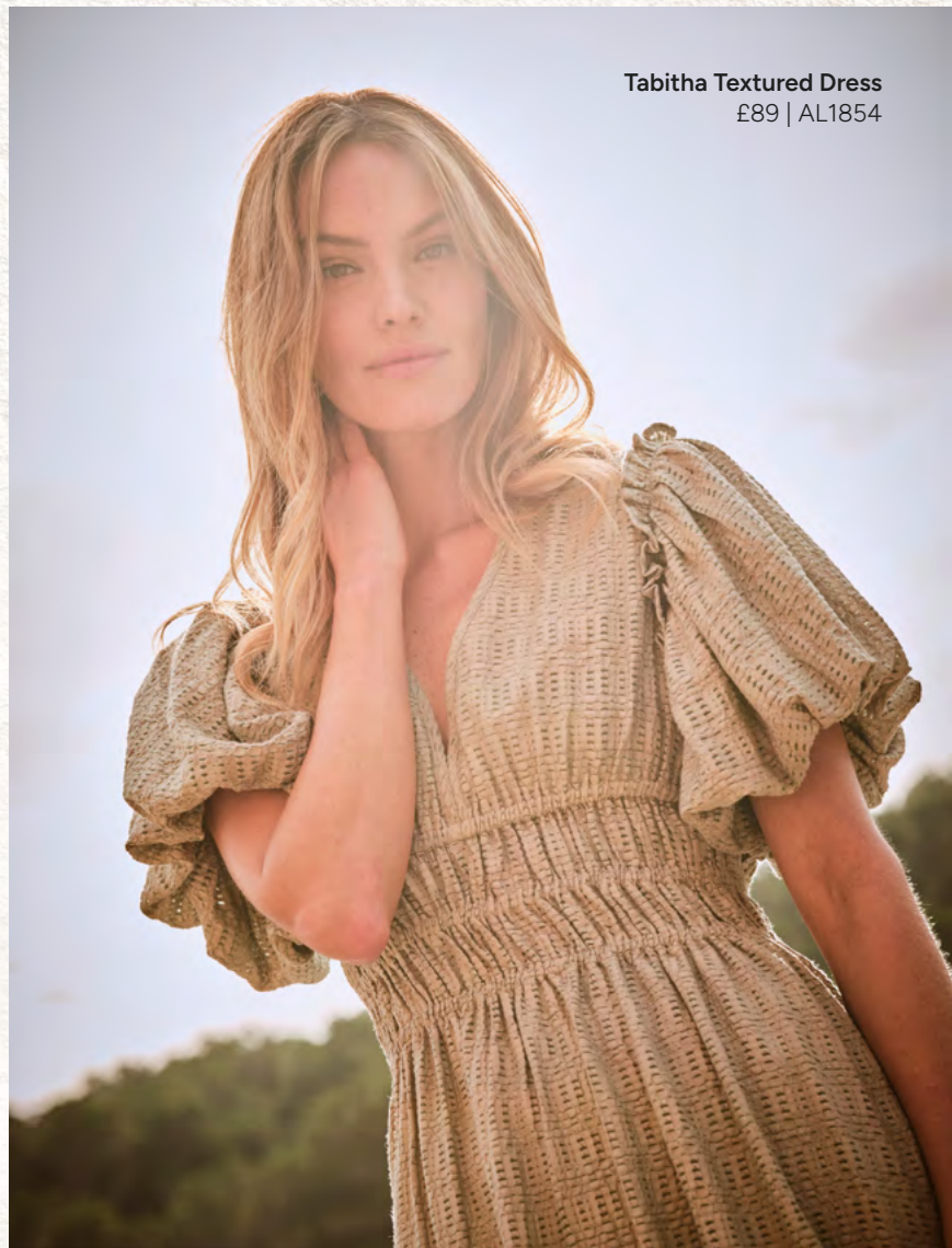
Tabitha Textured Dress £89 | AL1854