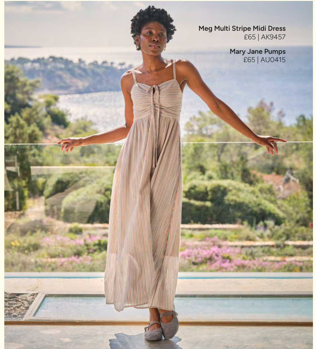
Meg Multi Stripe Midi Dress £65 | AK9457