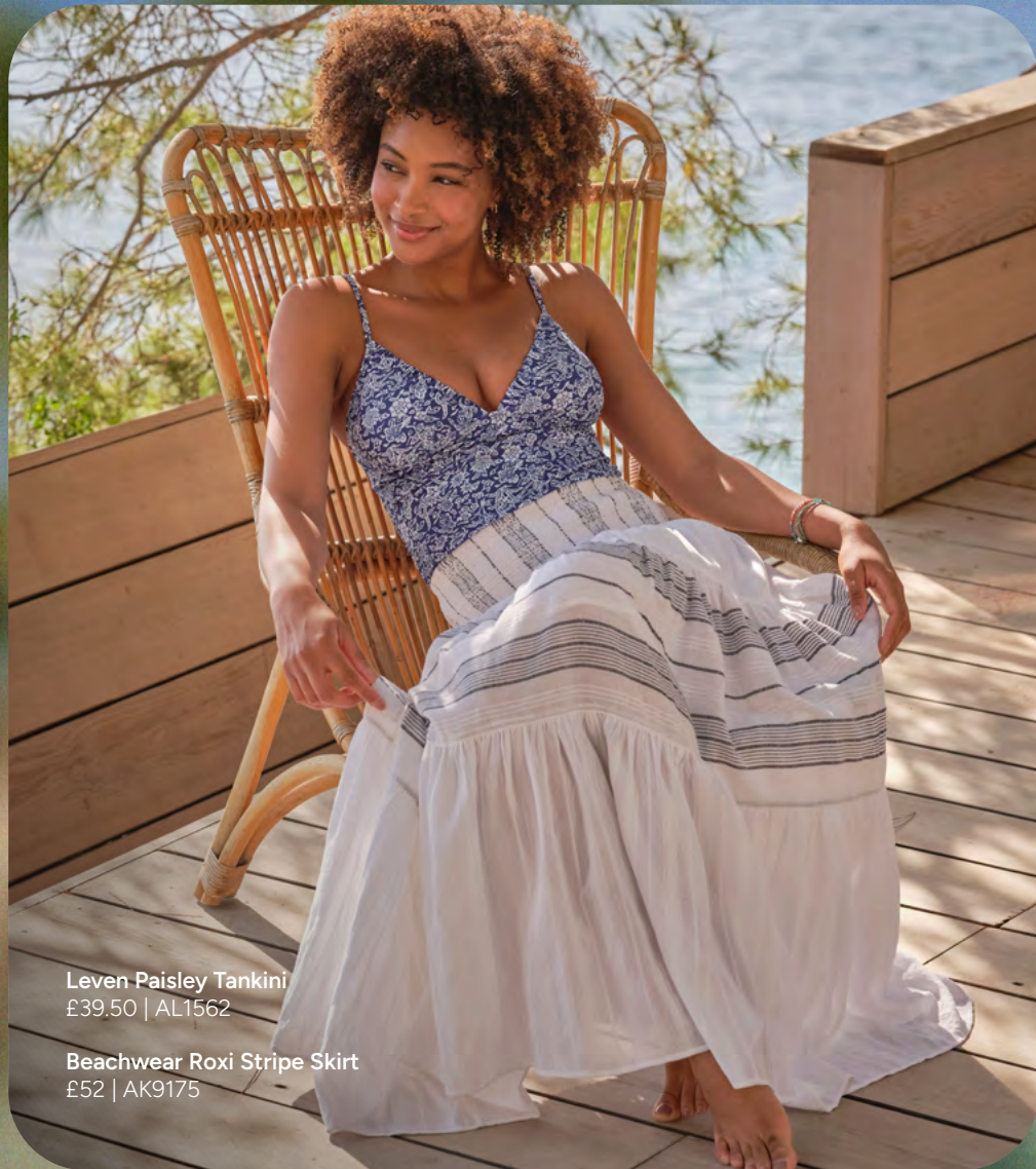
Leven Paisley Tankini £39.50 | AL1562