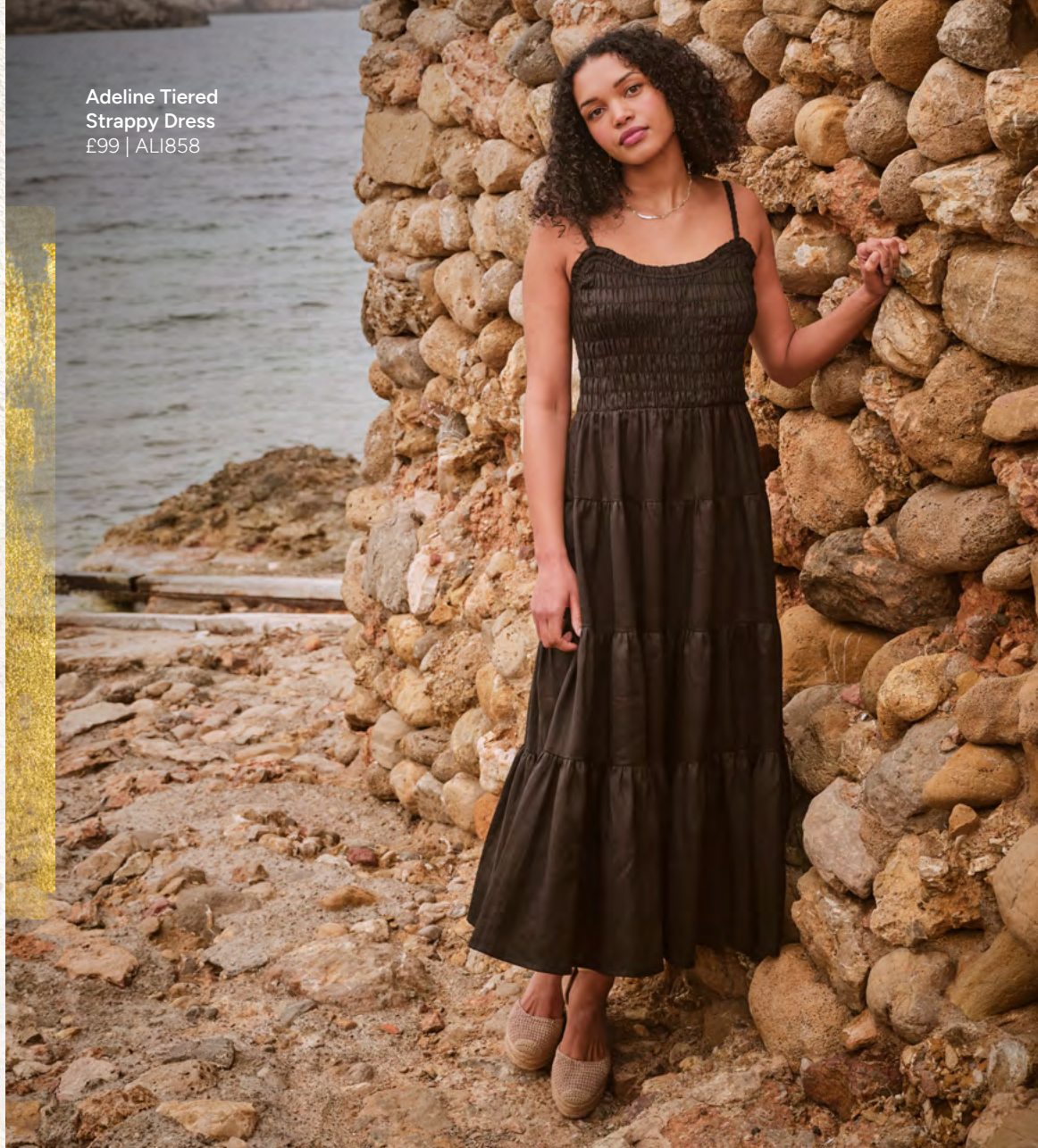
Adeline Tiered Strappy Dress £99 | AL1858