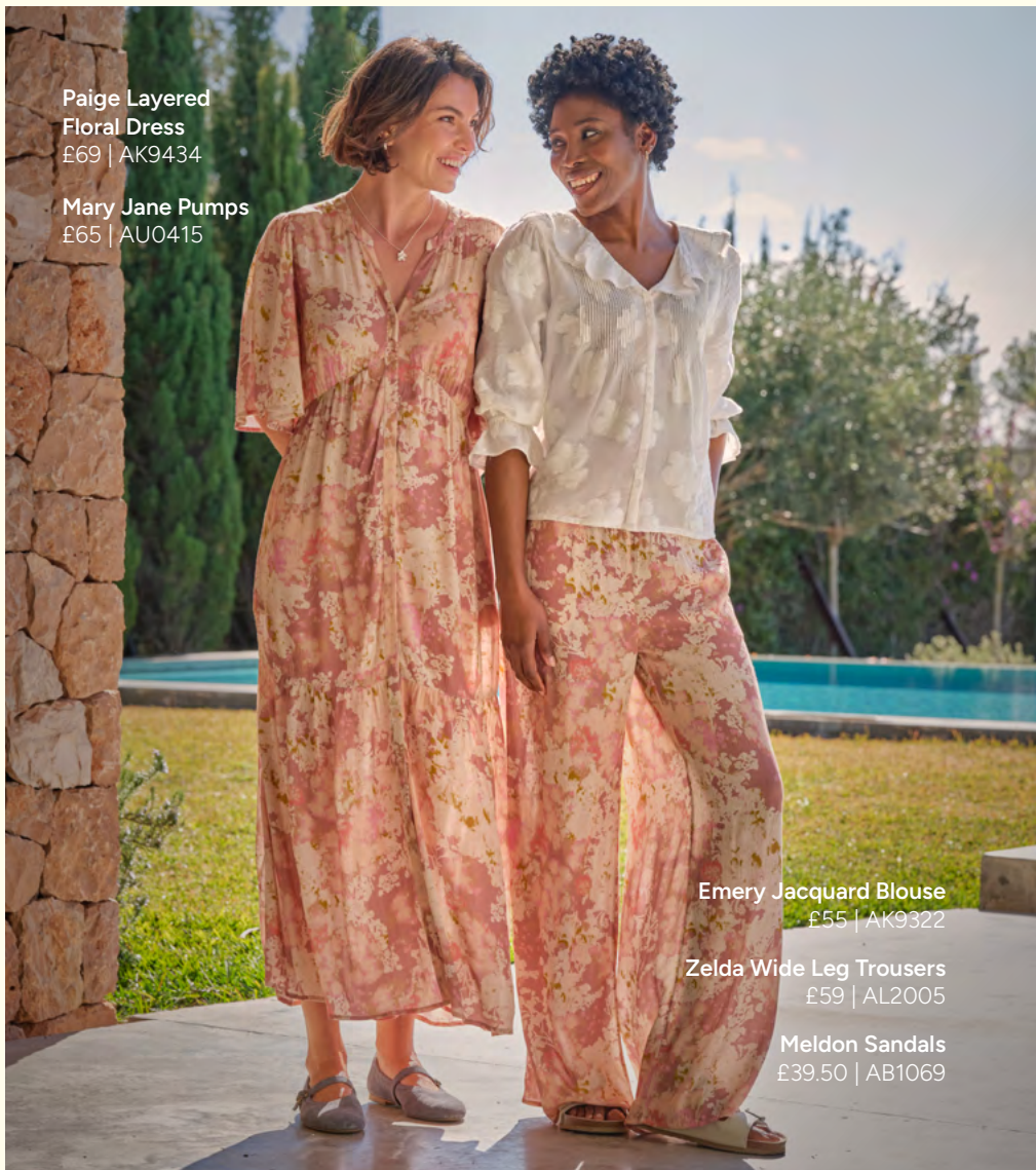
Paige Layered Floral Dress £69 | AK9434