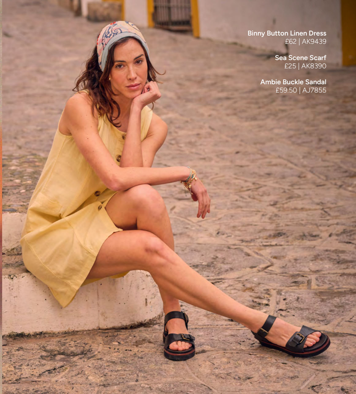
Binny Button Linen Dress £62 | AK9439