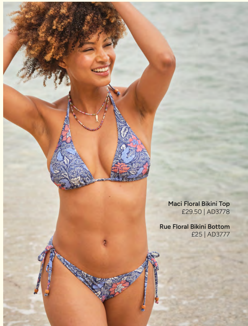
Maci Floral Bikini Top £29.50 | AD3778